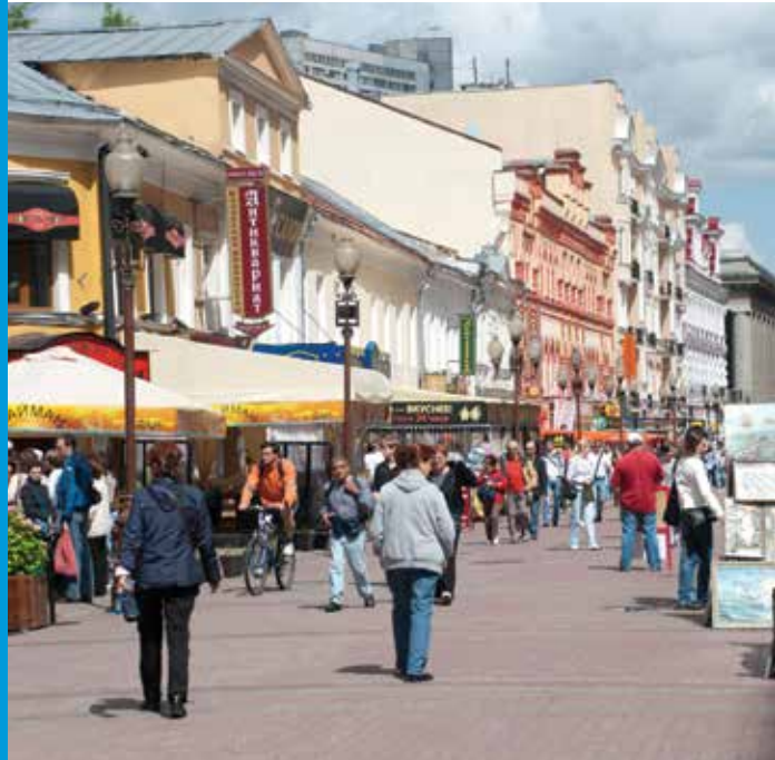
Pedestrian street in Moscow, Russia