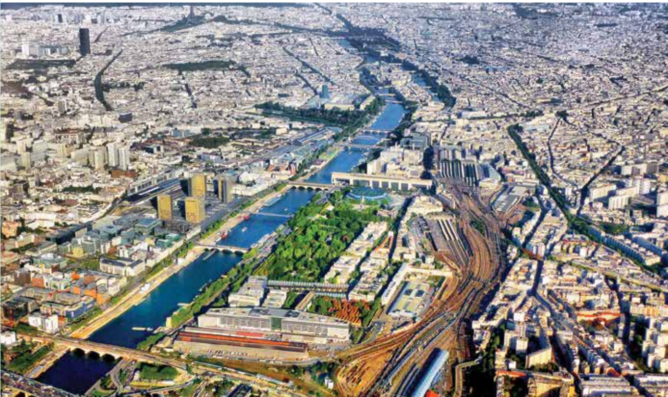
Aerial view of Paris, France