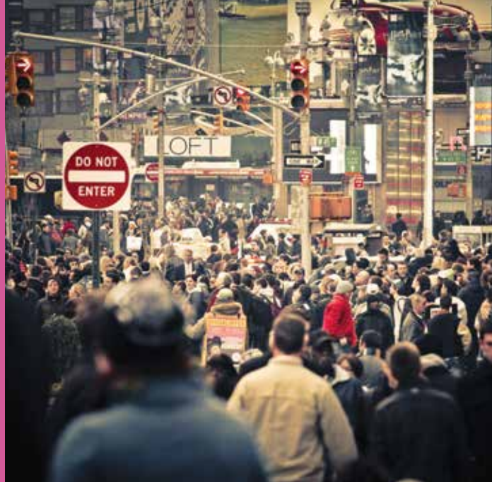
Street in New York, USA