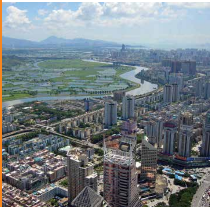
Aerial view of Shenzhen, China