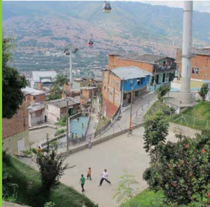
Public space in Medellín, Colombia