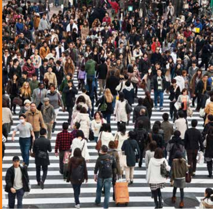
Pedestrians in Tokyo, Japan

Urban and territorial planning can contribute to sustainable development in various ways. It should be closely associated with the three complementary dimensions of sustainable development: social development and inclusion, sustained economic growth and environmental protection and management.