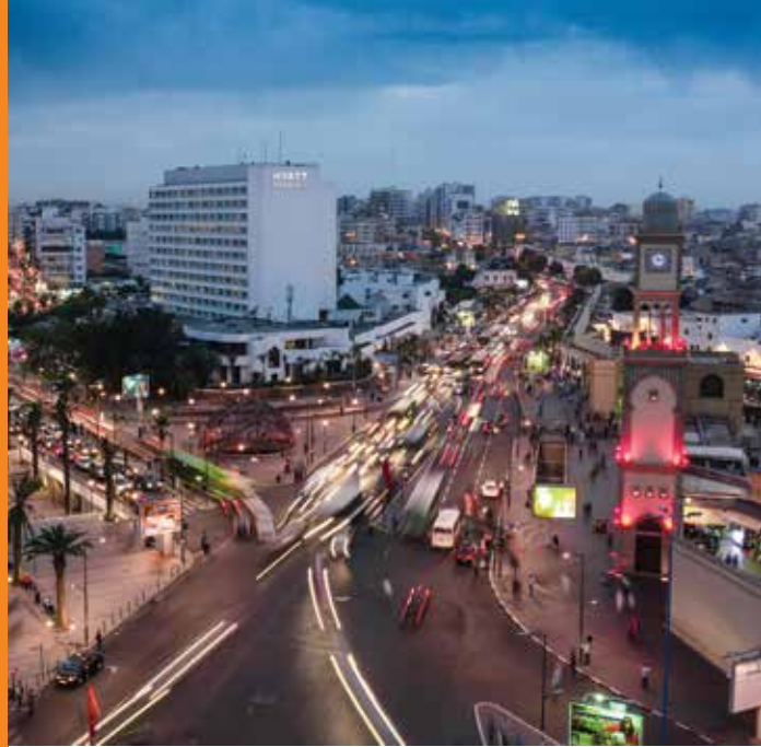
Place of United Nations in Casablanca, Morocco