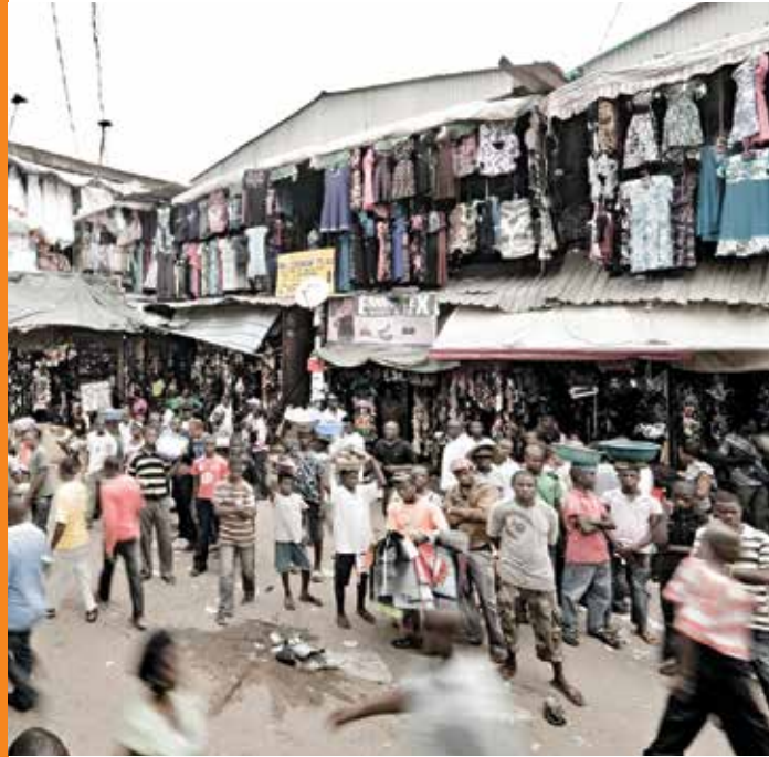
Market place at Onitsha, Nigeria